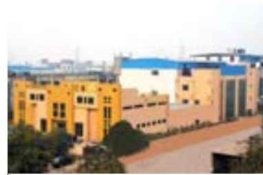
IKIO Plant 3