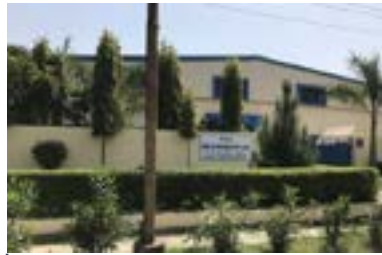
IKIO Plant 2