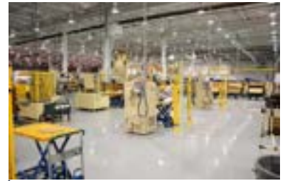
IKIO Plant 4