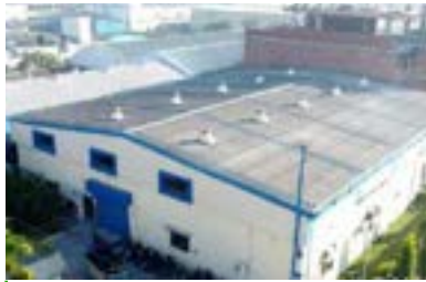
IKIO Plant 1