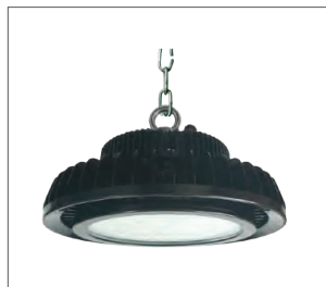
Hook Mount (100 V - 277 V only)