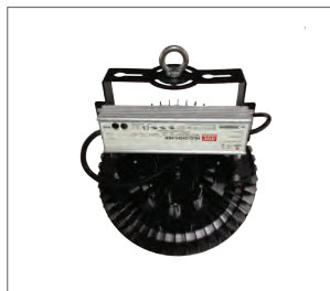
Type U Bracket (100 V - 277 V & 200 V - 480 V)