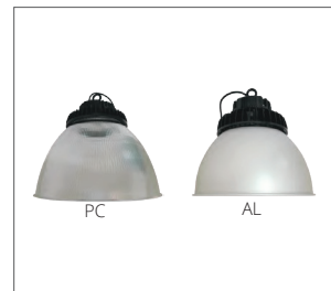
Covers 60°, 90°, 120° 16", 19", 22"