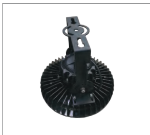
Flood Light Bracket adjustable angle (100 V - 277 V only)